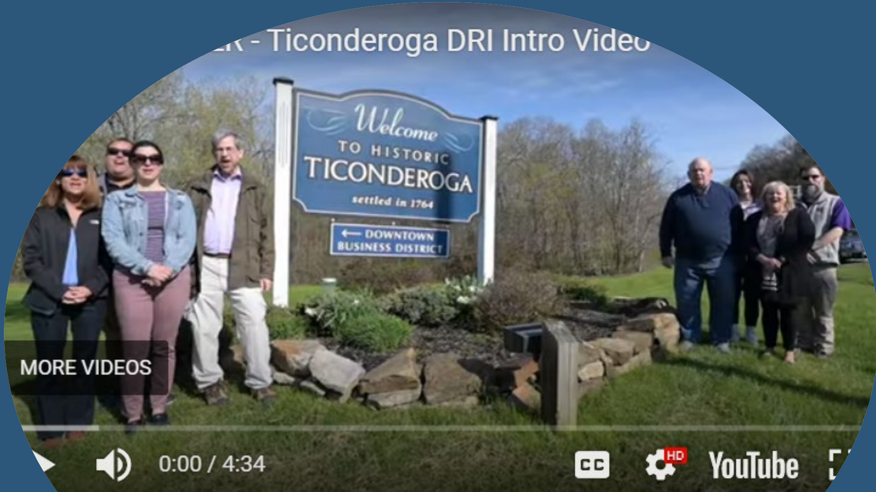
... - Ticonderoga DRI Intro Video